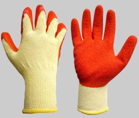
CS-L002 Size: 8-11

*Name: 10 gauge 5 yarns polycotton shell, wrinkle latex palm coated gloves *Liner: Polycotton *Palm: Latex