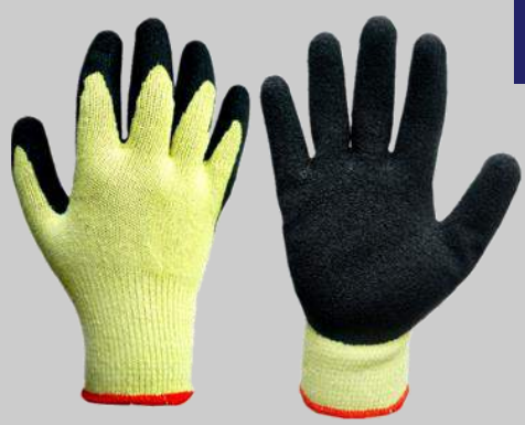
CS-L001 Size: 8-11

*Name: 10 gauge 2 yarns TC shell, wrinkle latex palm coated gloves *Liner: Polycotton *Palm: Latex